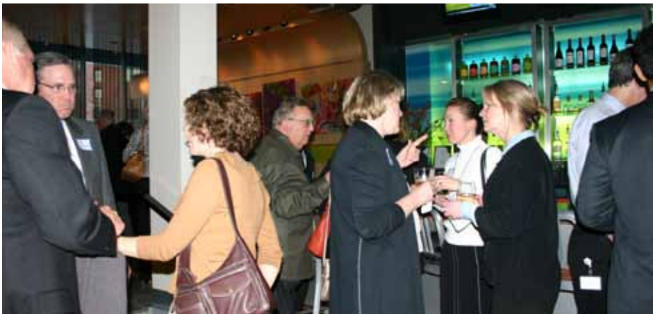
Rotarians packed the lobby of the new Aloft Hotel in Downtown Milwaukee for the March Networking Hour on March 4th.