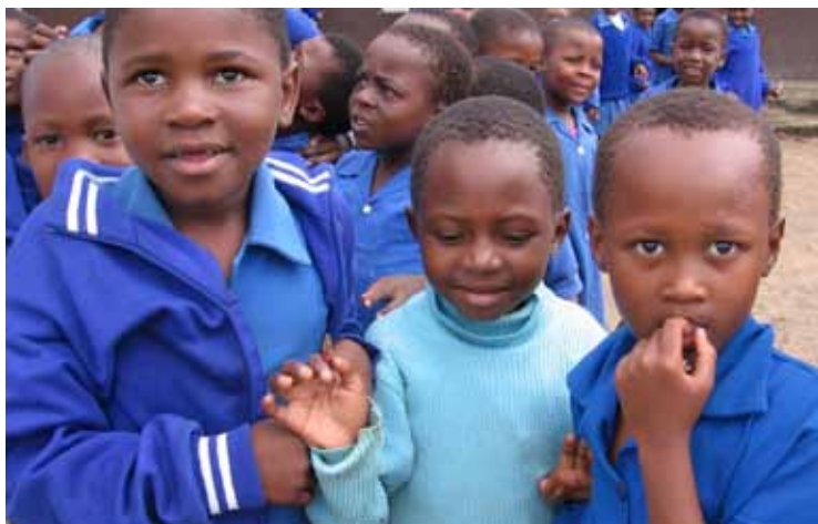
Children at the grade school in Swaziland.

In the spring of 2009, several members of the World Community Service Committee pooled personal funds with club funds to contribute $7,000 to the McCorkindale orphanage in Manzini, Swaziland. This is a partnership with a New Zealand Rotary World Community Service group, plus Rotary Clubs in Japan, Scotland, Swaziland. The funds were matched 4:1 by the New Zealand government. Our donation was specifically intended to build a new irrigation system for the farm adjacent to the orphanage, with the goal of increasing the productivity of the farm to provide income for the orphanage.