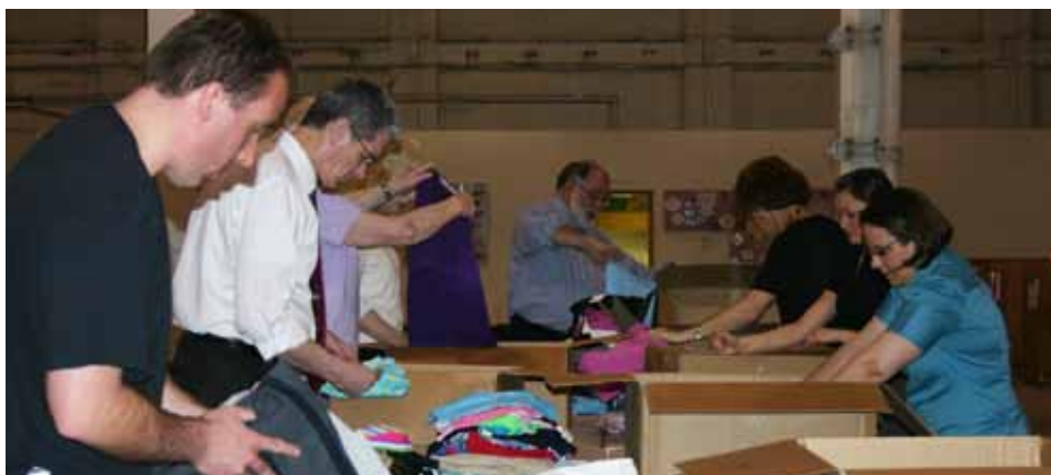
Rotarians sorted donated clothing and home goods at Corporate Care on April 15th. Thank you for volunteering!