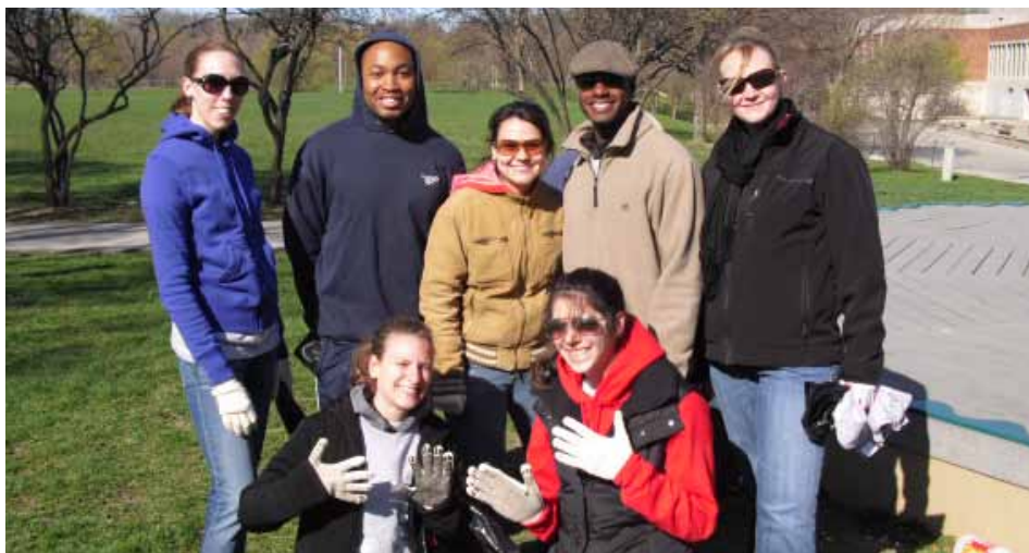
Rotaractors volunteered with Friends of Milwaukee's Rivers to do river clean up on April 17th.